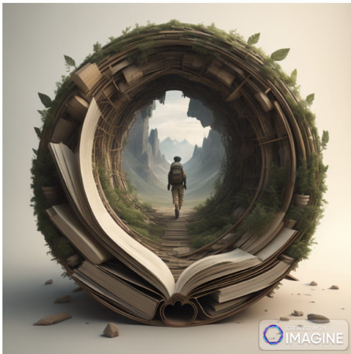
Image Representing Chapter 32 Titled “Expanding your NoleJ” (ETAD 402, 2023)

To facilitate the writing process, a template was provided to guide the teachers in authoring well-balanced chapters that analyzed the affordances, constraints, and tensions associated with AI education (Table 1). We assigned the textbook a Creative Commons Attribution Non-Commercial Share Alike 4.0 International Licence (CC-BY-NC-SA-4.0); however, GAI images are uncopyrightable. Building on Sullivan et al.’s (2023) research into ChatGPT, academic integrity, and student learning, we asked each teacher to be transparent in documenting the role of GAI in their assignments. For example, one author acknowledged: