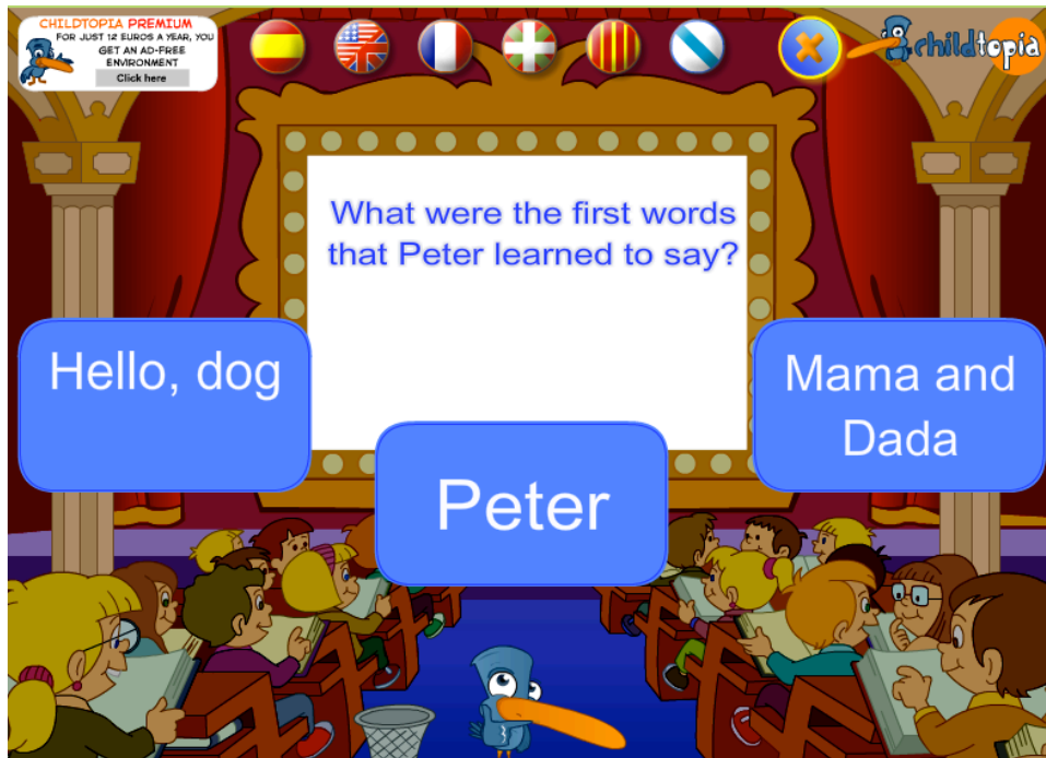
Figure 2: Example of post-reading comprehension question from ChildTopia™